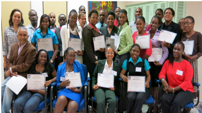
Participants of the Data Analysis using Microsoft Excel and R Statistical Workshop