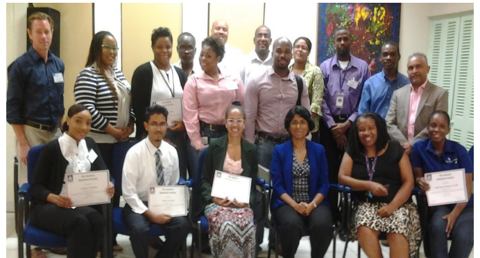
Participants of the Leveraging Data for Evidence Based Decision Making Workshop.