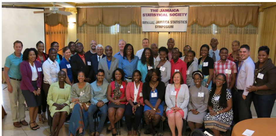
Attendees at JASSYM 2015 Statistics Symposium